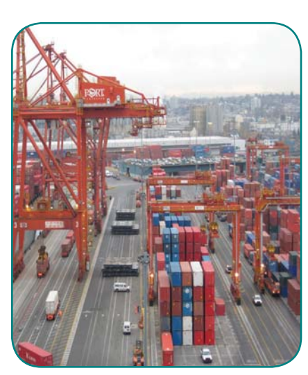
Figure 3: Gantry crane 'arms' and 'rover' containers

For the reacquisition test, we used the same 6 m baseline. This time, we ran the test using an OEMV-2 receiver with L1-only heading models. This test shows the reacquisition times of the L1-RTK-based heading solution. To force a reacquisition, we blocked all signals to the receiver for 3 seconds. After the receiver achieved the expected heading type, the receiver waited another 120 s before moving to the next iteration of the test. The plot in Figure 7 , on Page 4 , is based on 330 test samples.