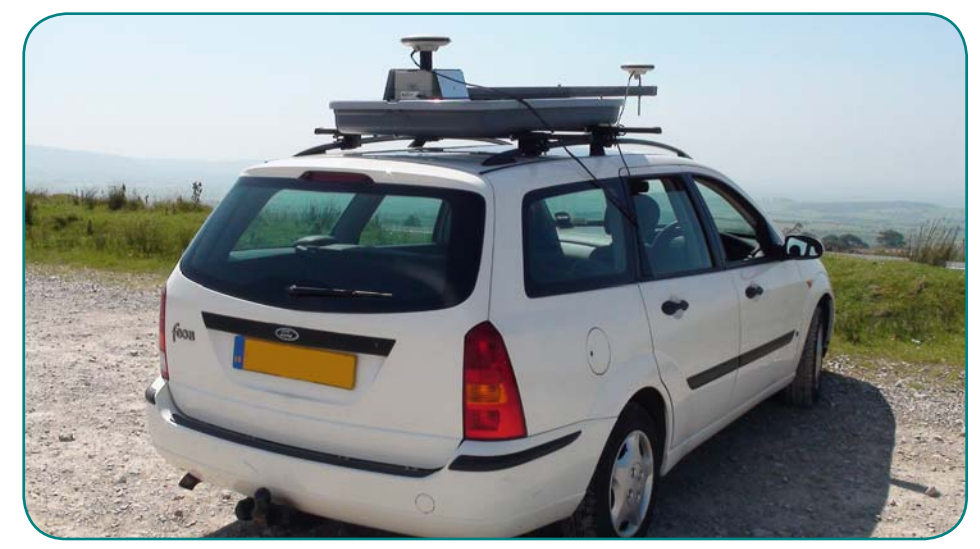
Figure 8: The van setup, ready for its return journey from the Abbeystead region of Lancashire to Lancaster, to continue dynamic ALIGN testing

Location: Lancashire, England Description: ALIGN testing with Forsberg Services