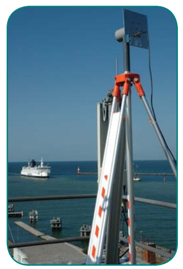
Figure 1: A static base antenna with one or more rover ships in port.

The results from NovAtel's ALIGN heading solution provided a more convenient way of computing heading, rather than deriving heading from the XYZ components of a typical 'moving base station' solution.