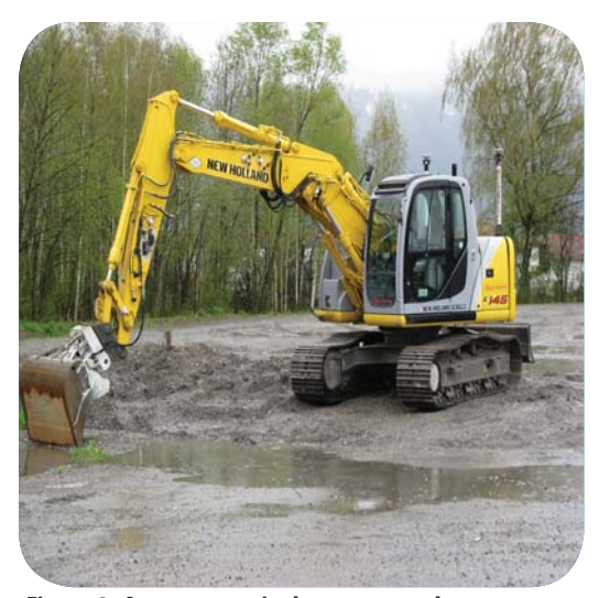
Figure 2: One antenna is the master and one antenna is the remote on this digger. They receive corrections from an external RTK base (not shown).